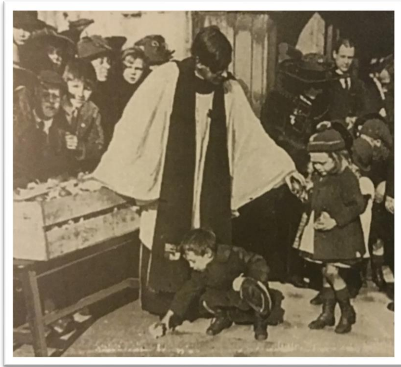
The first annual Oranges and Lemons service in 1920: Children are given oranges and lemons as they leave St Clement Danes Church